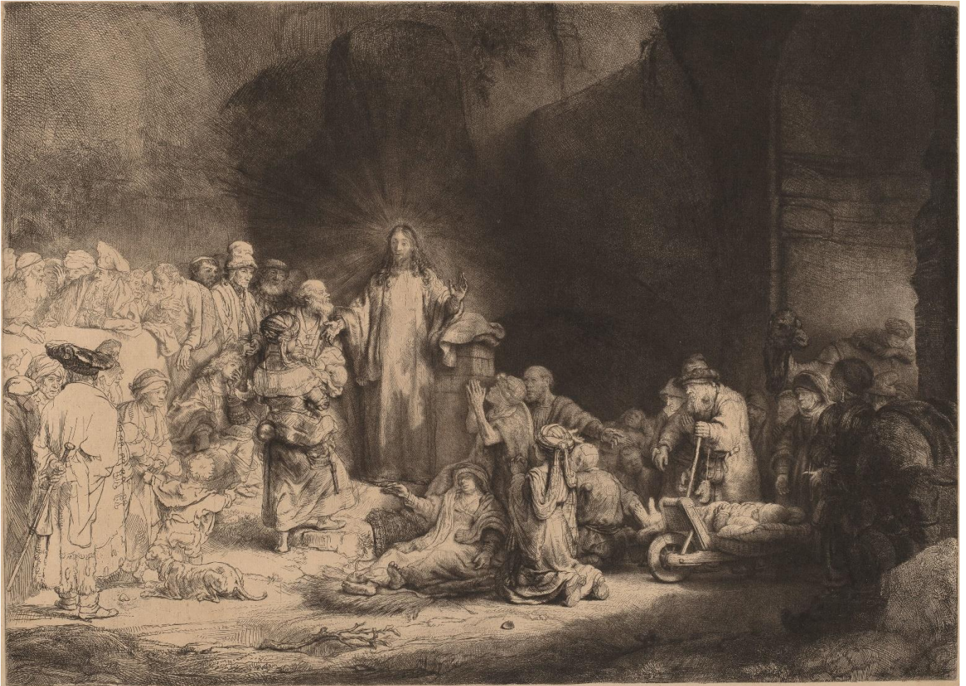
Christ healing the sick - Rembrandt von Rijn