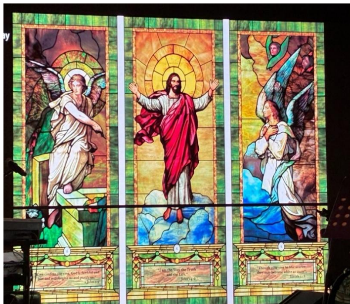
This is the image that was shown on the screen