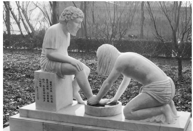
“Christ washes the disciple's feet” (2010), at Beijing Theological Seminary, China

When Jesus calls us to love God and love our neighbour, he makes Diakonia (service) a relational bridge into God's mission. By caring for the marginalised, we embody Christ's ministry in the world. Community service is an integral part of the Uniting Church's history, mission, and vocation.